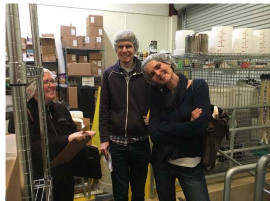
Project team members visit El Pájaro incubator kitchen in Watsonville to learn from its success

Future: We are working with Capsity, Inc. (a California Benefits Corporation that runs a successful co-working space) to finalize the business plan. We will develop business training curricula to fit Sacramento and our participants. The first phase of the project will provide business training and one-on-one mentorship to low-income small business startups while we finish the build-out of the Alchemy Kitchen commercial production site.