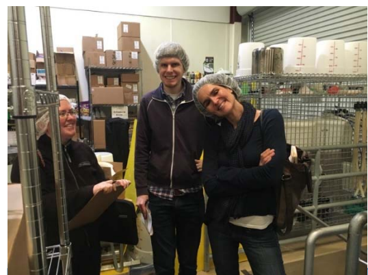
Project team members visit El Pájaro incubator kitchen in Watsonville to learn from its success

Future: We are working with Capsity, Inc. (a California Benefits Corporation that runs a successful co-working space) to finalize the business plan. We will develop business training curricula to fit Sacramento and our participants. The first phase of the project will provide business training and one-on-one mentorship to low-income small business startups while we finish the build-out of the Alchemy Kitchen commercial production site.